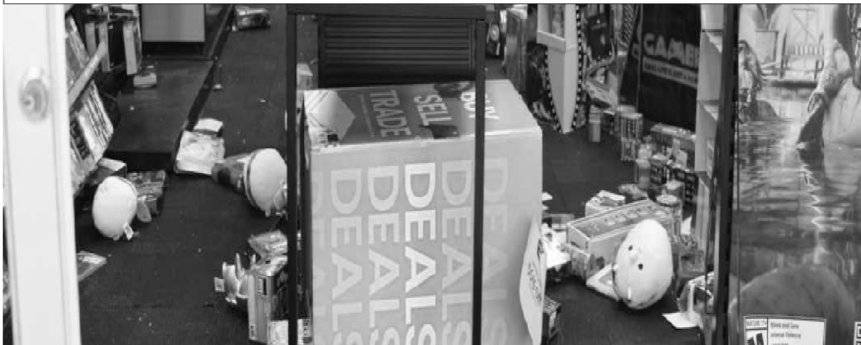
Image description: a photograph of a Gamestop in so-called “Memphis, Tennessee” during late January 2023 which was looted in retaliation for the murder of Tyre Nichols by the police. Throughout the shop are various plushes thrown around, with many games and accessories empty from the shelves. In the middle of the photograph is a white bar edited onto the picture, with a phrase in its middle that says “Looting is Good”. Ironically, directly below the phrase “Looting is Good” is a tipped over box inside the actual Gamestop which says “deals deals deals deals deals”.

Read more at: https://fighteugenics.noblogs.org/