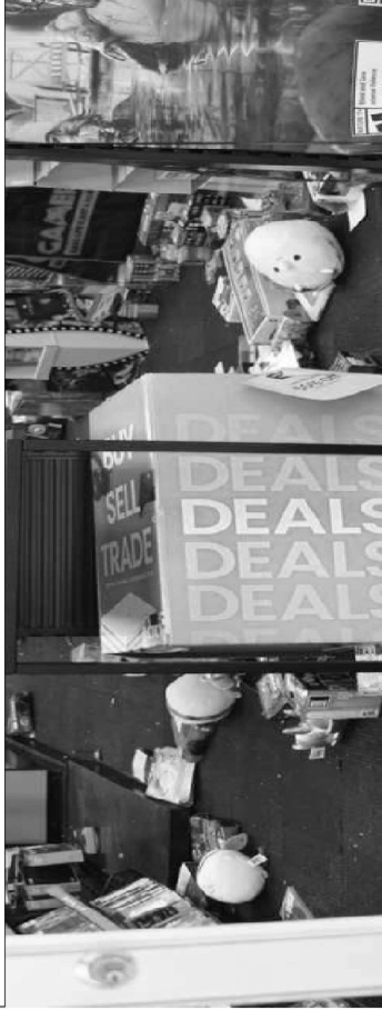
Image description: a photograph of a Gamestop in so-called “Memphis, Tennessee” during late January 2023 which was looted in retaliation for the murder of Tyre Nichols by the police. Throughout the shop are various plushes thrown around, with many games and accessories empty from the shelves. In the middle of the photograph is a white bar edited onto the picture, with a phrase in its middle that says “Looting is Good”. Ironically, directly below the phrase “Looting is Good” is a tipped over box inside the actual Gamestop which says “deals deals deals deals”.